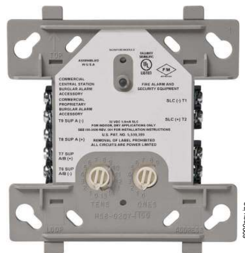
FMM-1(A) (Type H)

Use to monitor a zone of four-wire smoke detectors, manual fire alarm pull stations, waterflow devices, or other normally-open dry-contact alarm activation devices. May also be used to monitor normally-open supervisory devices with special supervisory indication at the control panel. Monitored circuit may be wired as an NFPA Style B (Class B) or Style D (Class